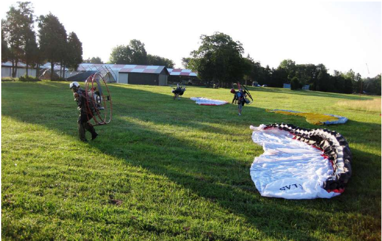
Kiting up in the morning at the Warrenton Airpark (7VG0).