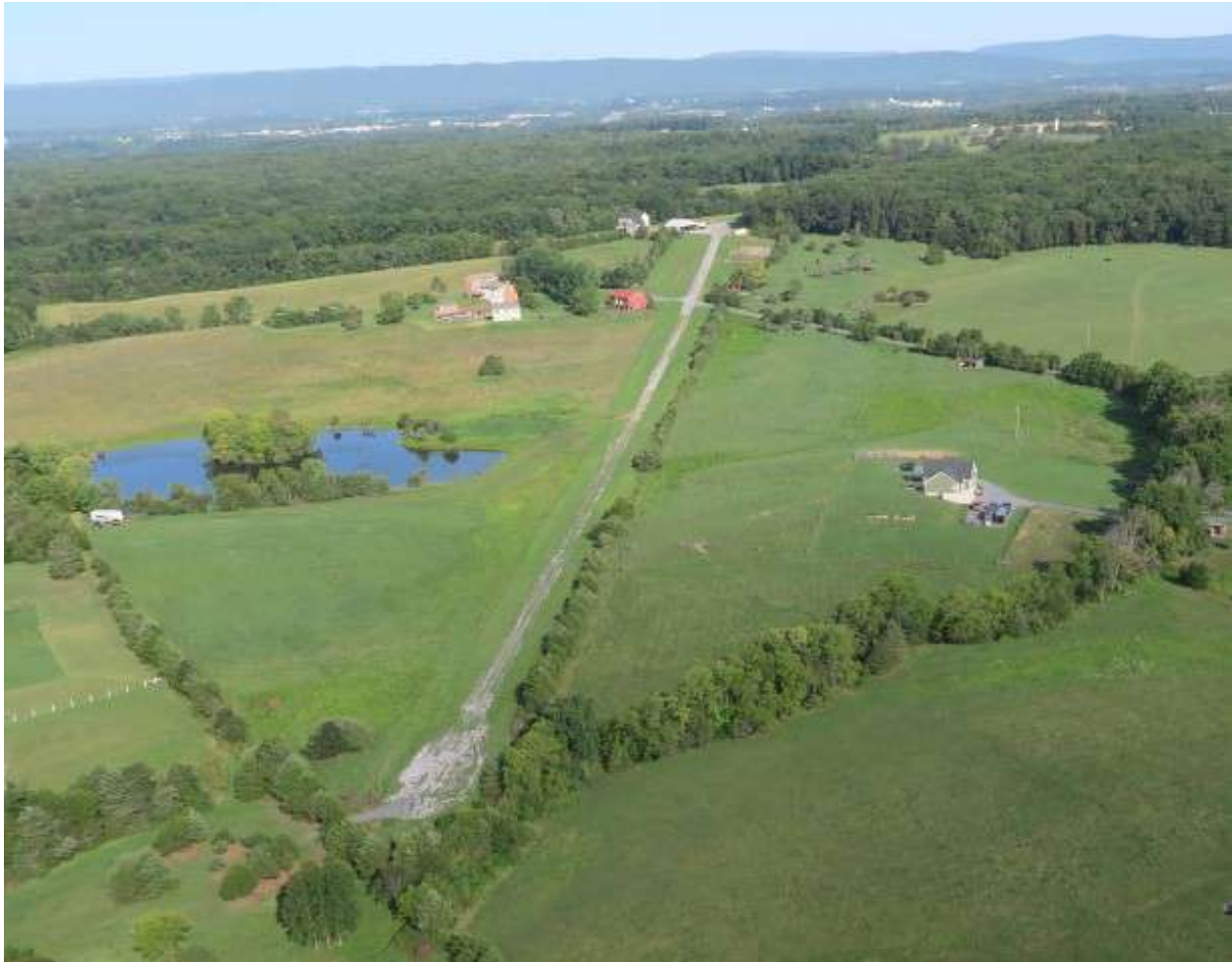
Haynes looking west. The field rises 100' to the hangar at the west end.

The airstrip, however, is steep and narrow. The asphalt is in poor condition.