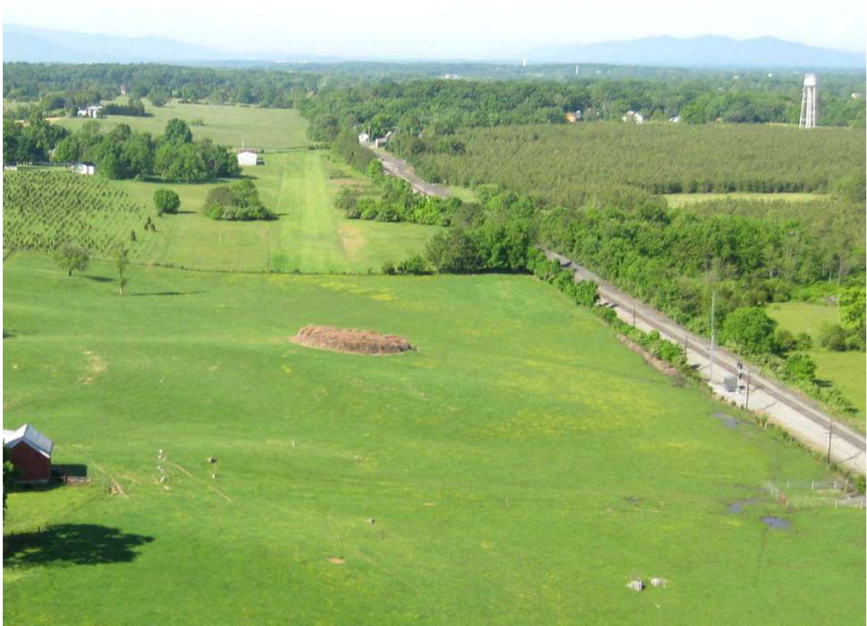
White Post looking south