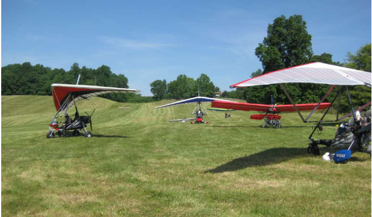
Seven Club 1 flyers at Pleasantdale (4VA9) on the 2012 Poker Run.