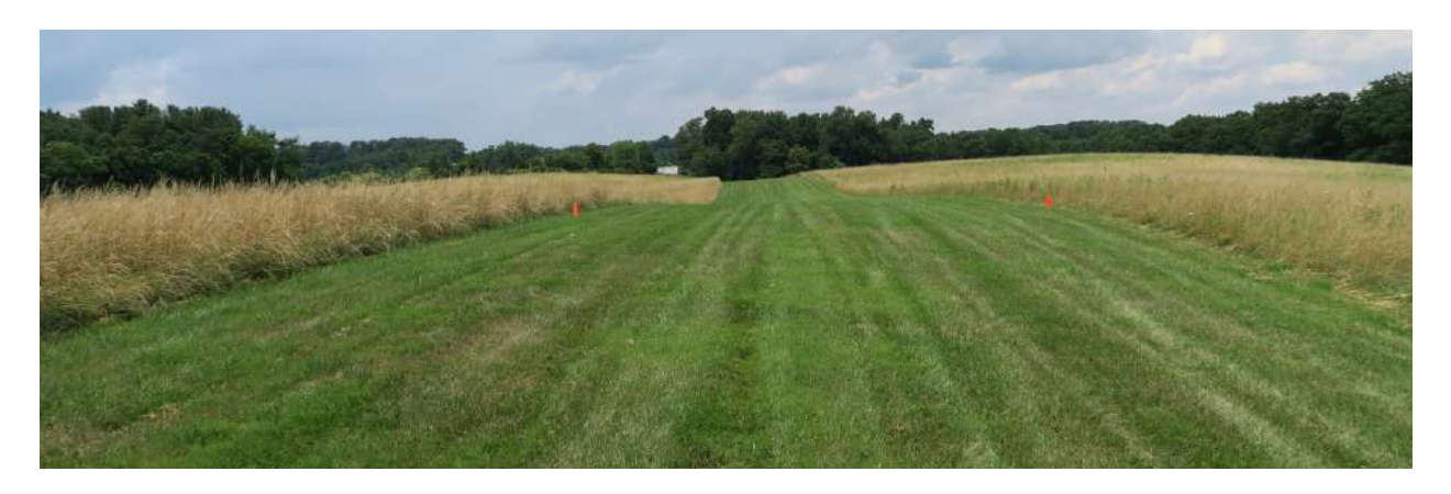
Looking north from near the crest. Note the dip in the middle and the tall trees at the end.