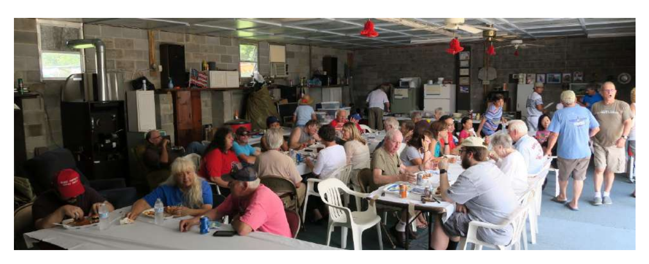
Capital Area Light Flyers (Club 4) pot-luck at Eyler Field