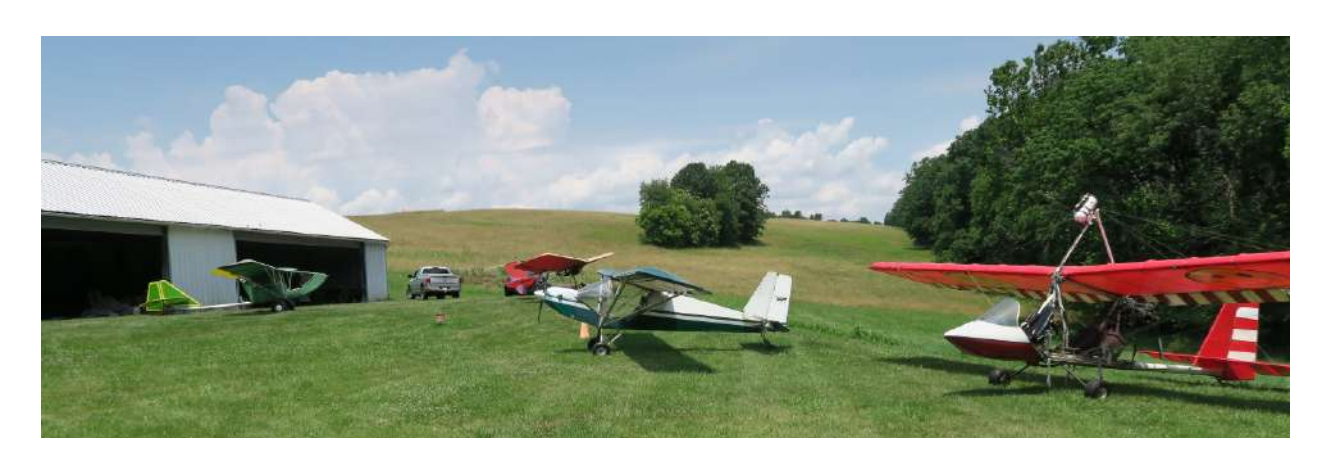
Club 4 aircraft. The south end of the runway goes up that hill, off behind the hangar.

Eyler Field. Do you want a challenging field? Go land at Eyler. It's not on the chart and it's not for newbies, but we're welcome to land there. If you want to practice landing up a 10% slope, this is the place. The field is something of a roller coaster with the whole south half basically being a hill with a rise of 80' from the south end of the runway to the crest. Because of the hill - and the tall trees at the north end - you should land to the north and take off to the south.