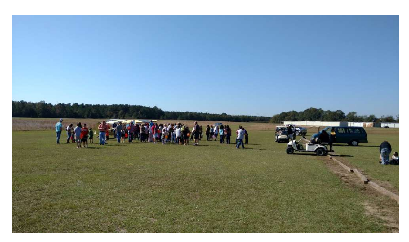
Meeting the plane and pilot after the candy drop

Once all the excitement had died down, I decided to fly over to Twin Lakes Airpark (S17) with a Stearman. This was a neat little airpark with a vibrant and active flying community. Everyone rides golf carts around to go visit each other. If my dream of having a private airstrip on a ranch doesn't work out for me, this might not be a bad alternative!