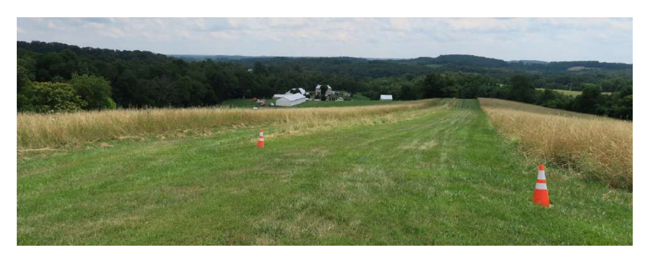
Looking south from near the crest. That hangar is 100 feet below you. You'll be landing on an upslope of almost 10%. Takeoff will be easy. Warning! You cannot see this part of the runway from the north end.