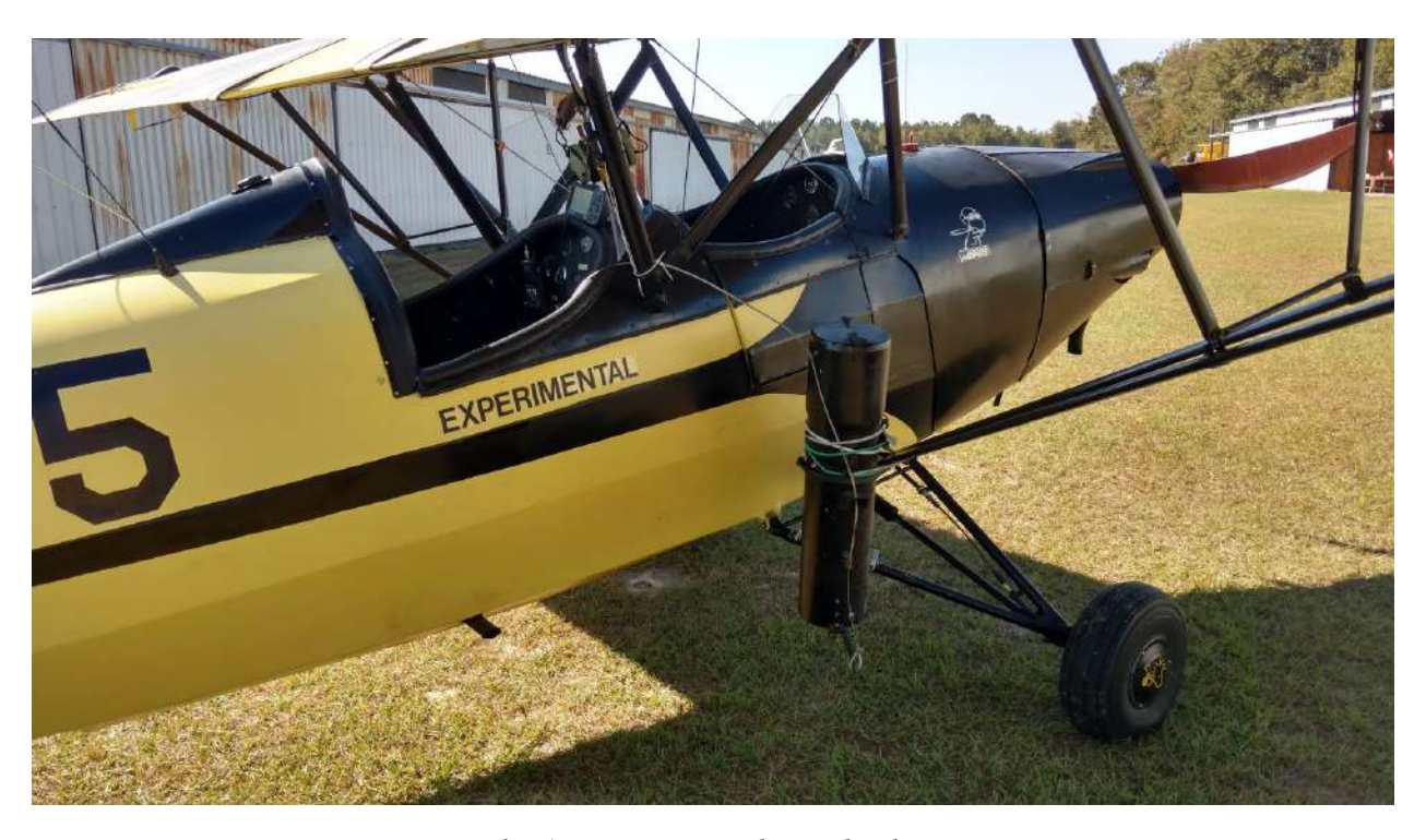
The Acey Deucy with candy chute

The Saturday before Halloween, the Trenton Flyers held their annual candy drop. This is a chance to get local kids out to the airport for some Halloween fun! An Acey Deucy, specially outfitted with a candy chute controlled from inside the cockpit made several low passes down the wide taxiway at Trenton, dropping candy each time. To ensure that no kids got left out, each drop alternated between the older kids and the younger kids. All appeared to have a great time, with many excited children and parents.