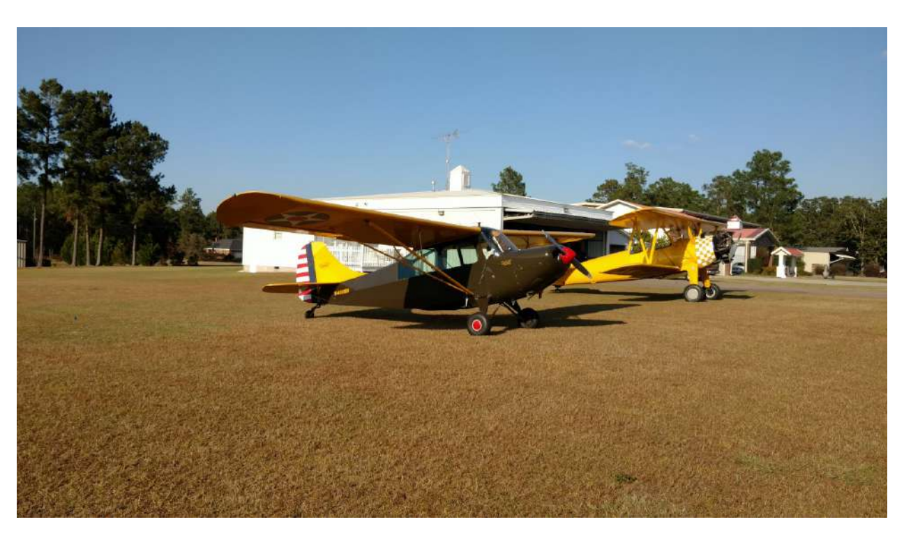
Parked at Twin Lakes