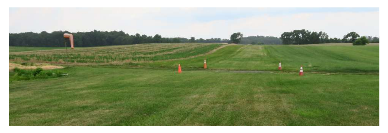
Harrison's looking north.

Harrison Field (Flying H) (8MD5. It's only on the TAC, not the sectional.). This has long been the home field for Club 4 and a way station for those of us flying up to Shreveport North for the annual Father's Day Fly-in. I pass on this news: The farm did not sell at auction in June. The heirs did not get the price they wanted. They are keeping the airfield open, and indeed it's in good shape. It's a whole lot easier to land on than Eyler. We're welcome to fly there. There's a porta-potty on the field.