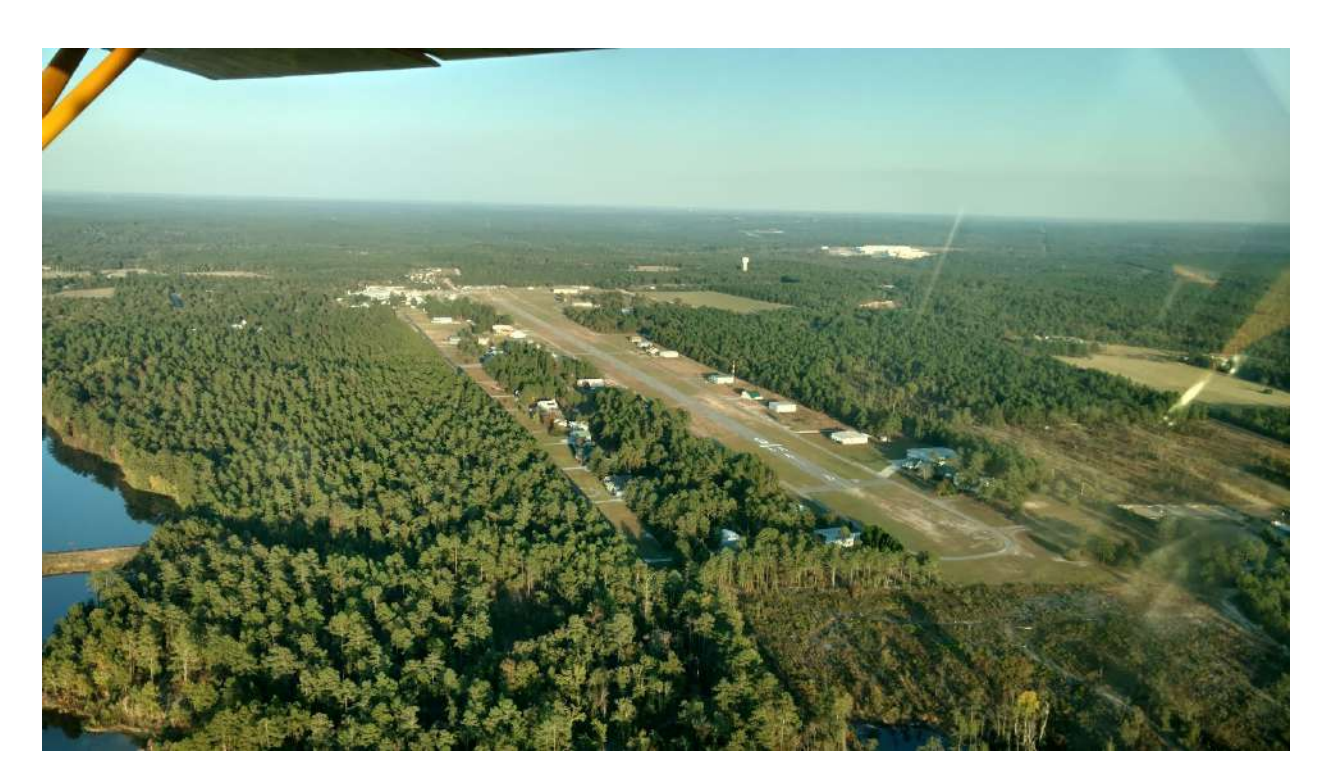
Twin Lakes Airpark