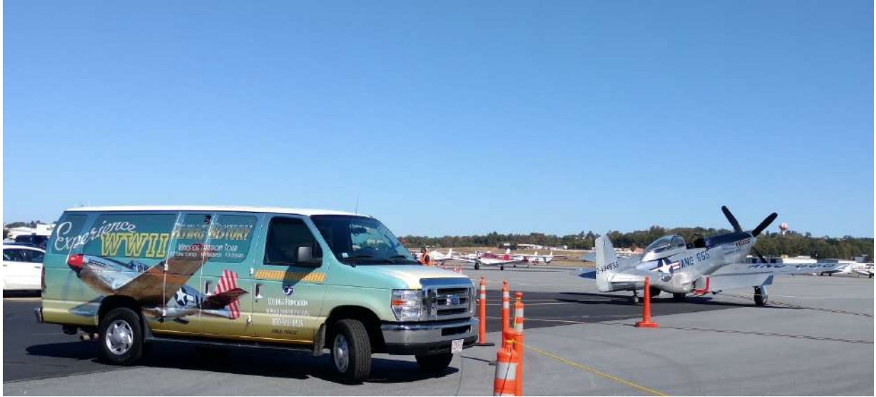
P-51D and support van