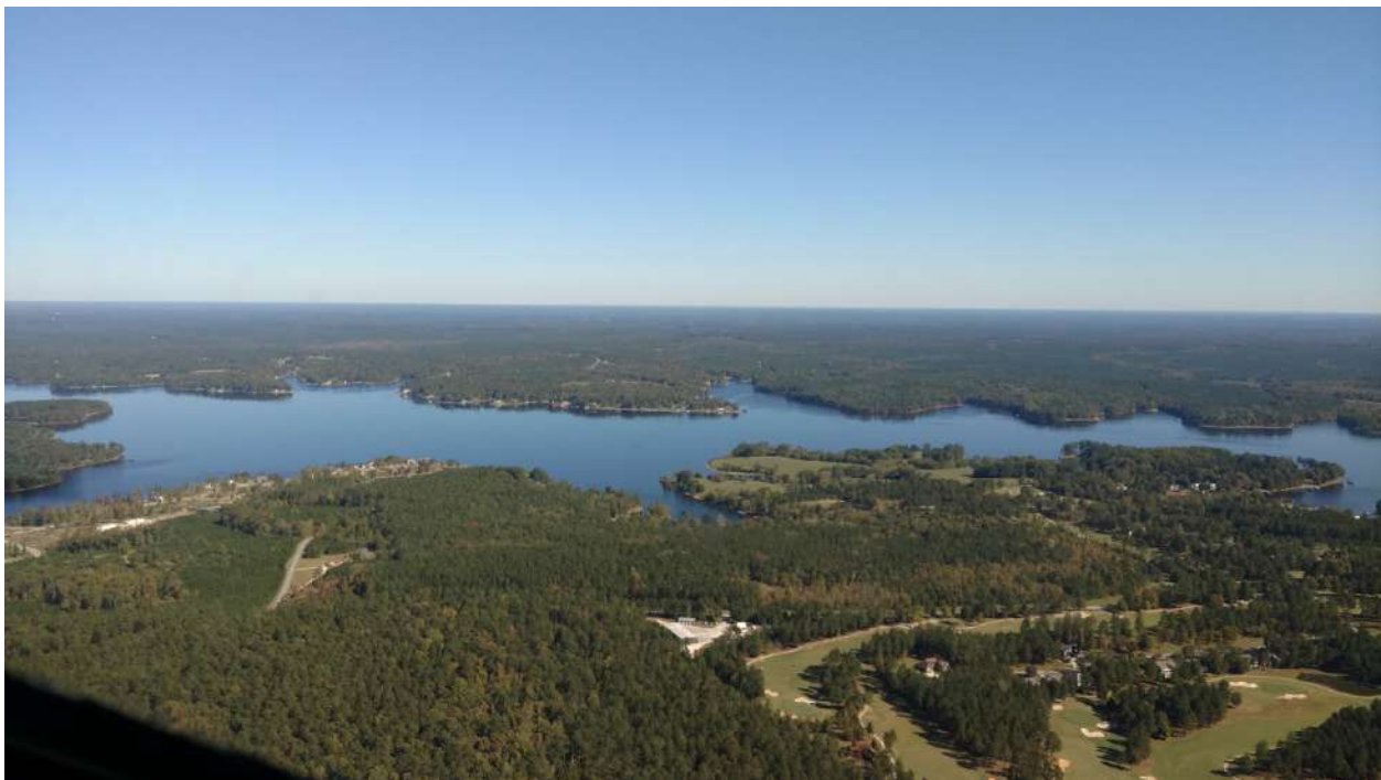
Lake on the way to Greenville, SC

The first twenty minutes or so of the flight were just over pine trees, pine trees, and more pine trees. Trying to keep my passenger interested in the landscape, I diverted a bit to fly over a nice lake I saw off to our right. It was beautiful, and there was a nice private strip near it.