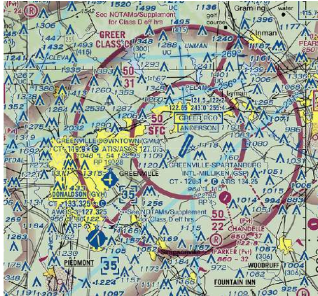
The airspace around Greenville, SC

As I was approaching the airport on the tower frequency I heard a strange radio exchange between the controller and an unknown aircraft (I don't remember the N number, so I'll just use N123 here):