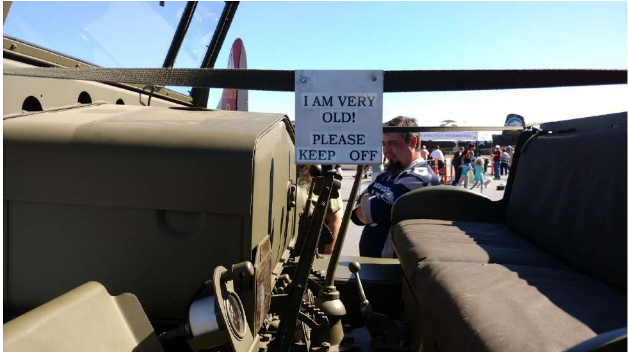
I am very old! Please keep off.