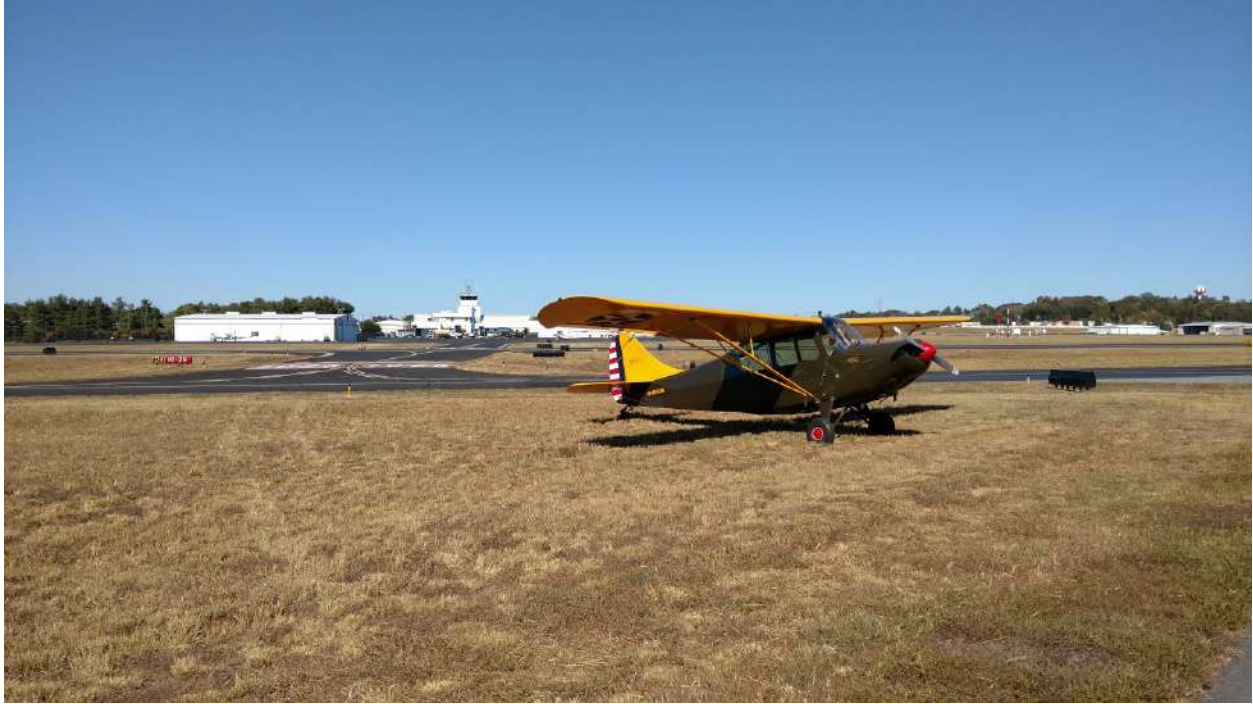
Parked in the grass

I parked the plane and walked over to see what was going on. The Collings Foundation ( collingsfoundation.org ) was there with their B-17, B-24, B-25 and P-51D! They also had several period vehicles, and the Military History Center of the Carolinas ( milhcc.org ) had set up a display of SC Military Aviation History. The only downside was that the restaurant was packed, but there was so much to see we didn't mind the short wait!