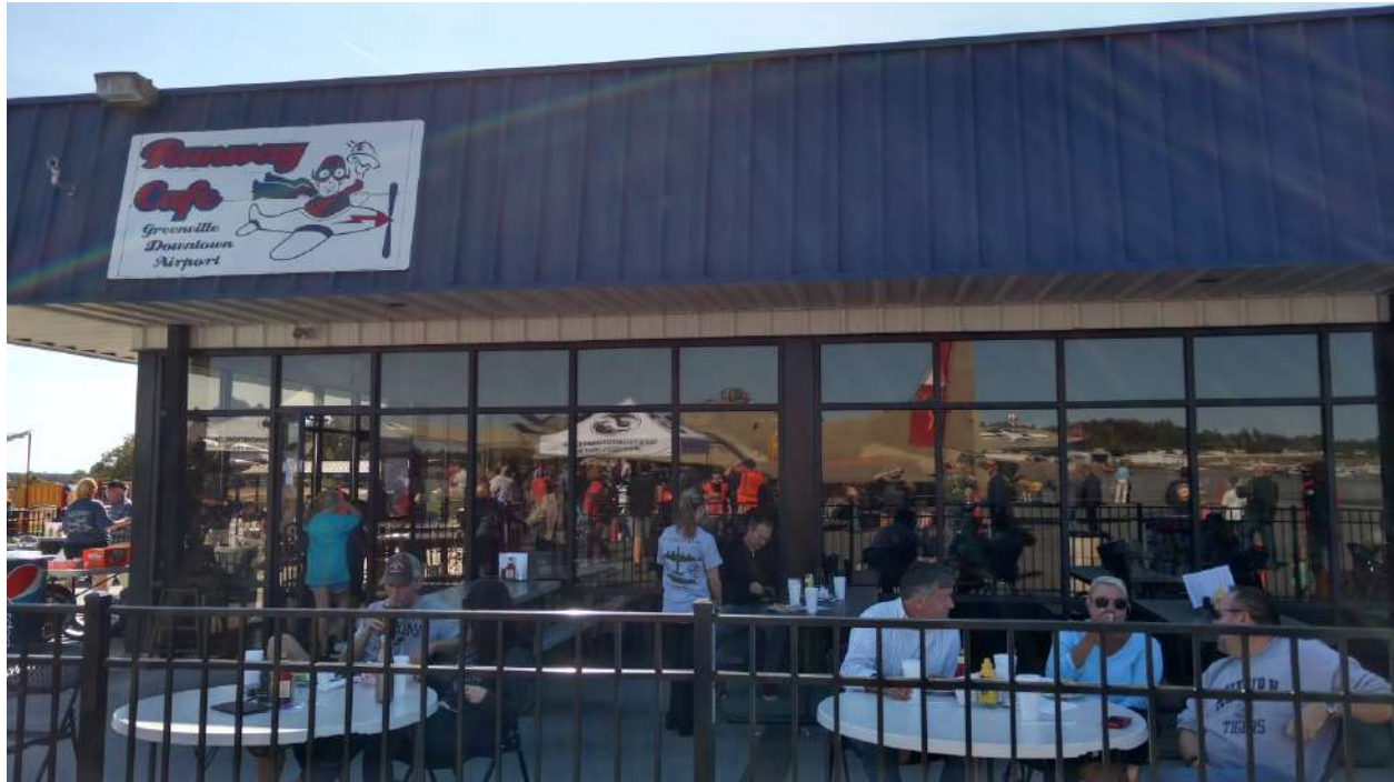
The Runway Cafe

The flight home was uneventful. We made a quick stop in Greenwood (KGRD) for fuel on the way back due to lack of fuel at my temporary (grass field) base. It is a big airport with a friendly staff and multiple runways, but it was practically deserted when we went there.