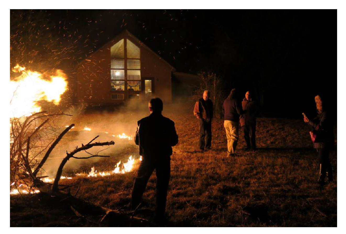
Note the ring of burning grass

The evening concluded with a HUGE bonfire, which turned out to be a bit larger and a bit closer to his house than Tom had expected.