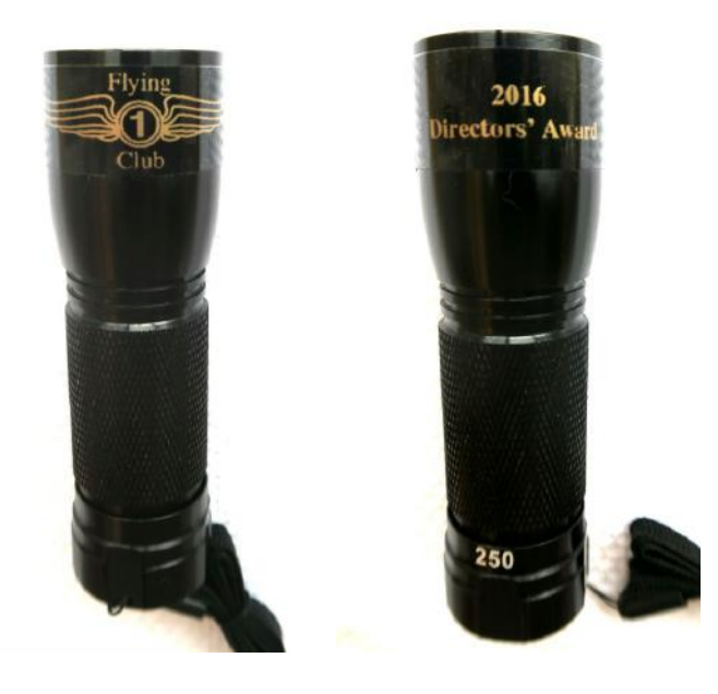
This year's awards

December, he was back being his usual everywhere self, wrangling people to join him for some winter flying on a cold sunny day.