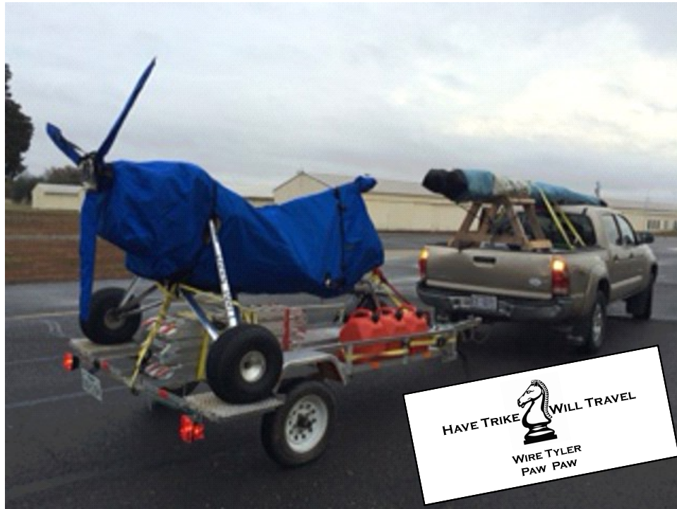
Pat Tyler heads south

We received the following “postcard” of sorts from Pat Tyler: