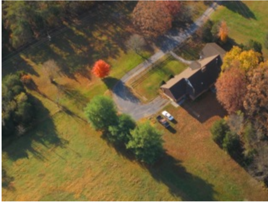
A spectacular example of the brilliantly colored trees seen on the flight