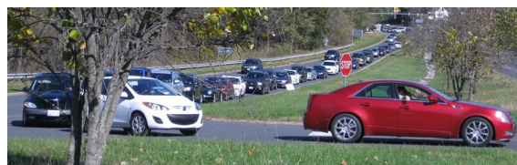
The Un-privileged View - Cars waiting to get onto Skyline Drive at Front Royal.