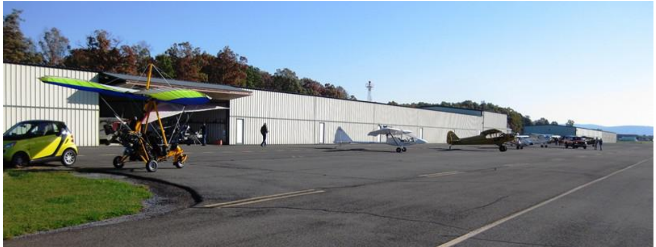
The flight line at Front Royal early on. More came.