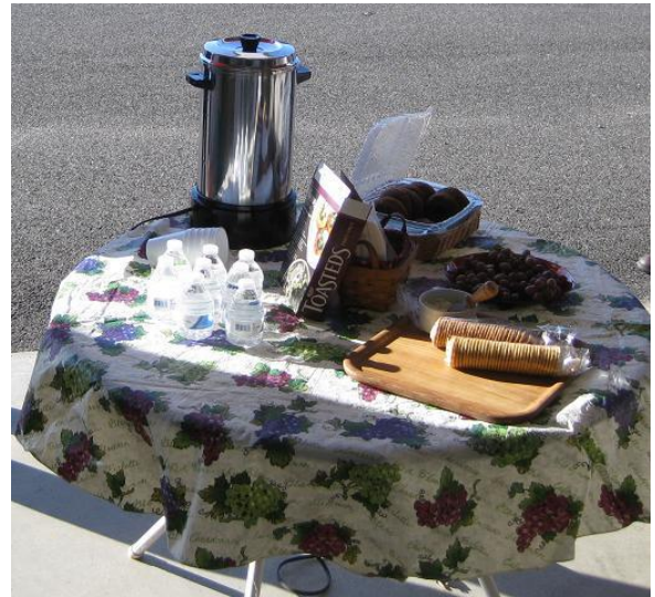
Fresh donuts & hot cider from the Apple House at Front Royal