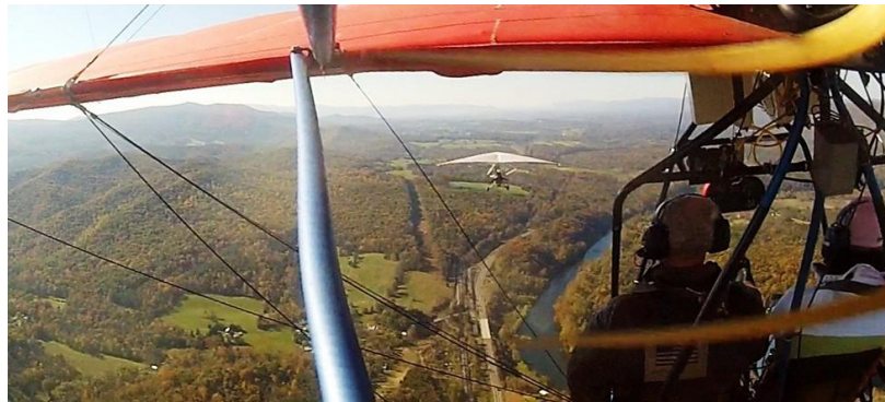
Our Privileged View - Looking south toward Luray. We are so fortunate.

Those of you who flew the event know why I call this column The Privileged View . The mountains were spectacular, as is this picture from Tom Simmons.