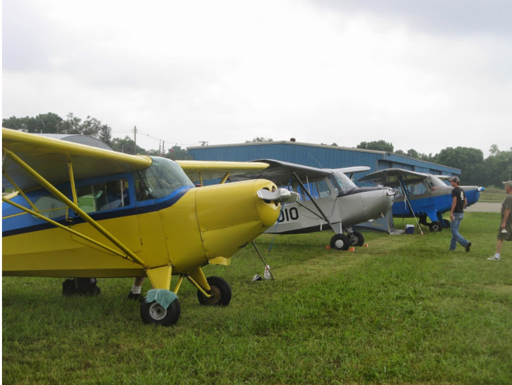
Part of the flight line at Middletown sitting under the gloomy sky

Due to the low attendance, at the banquet on Saturday evening, I walked out with an award for “Best Military Aeronca”. There were nicer L-birds than mine, but they all received higher honors. Still, now Rudolph has some bragging rights!