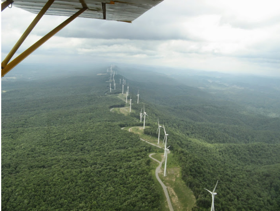
Windmills on the last ridge before descending into Upshur (W22)

weather here, it looked iffy, but we were confident that we could get at least a little farther, and we had no issue picking out several alternate airports (there are many in this area). We took off and flew for about another twenty minutes before it began getting noticeably darker and gloomier. We opted to turn around and head for Fayette County Airport (I23) to wait out the weather.