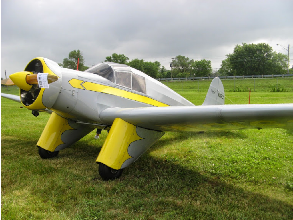
Rare low wing Aeronca LB