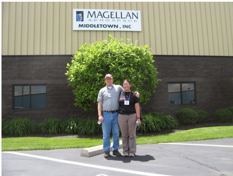
In front of the factory, which recently changed from "Aeronca, Inc." to "Middletown, Inc."