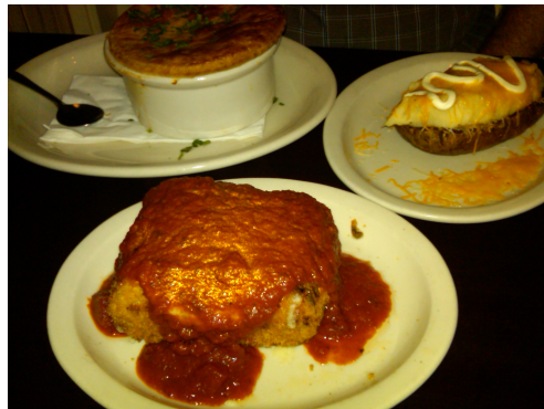
“Pasta Cube”, “Potato Yacht” and chicken pot pie at CJ Maggie’s in Buckhannon, WV. You won’t leave hungry!

Fortunately, Sunday turned out to be a great day for flying, and the trip home was fairly uneventful. We did get to stop in Upshur (W22) for lunch at the restaurant I like. All in all, it was a great trip and we are already looking forward to 2016, when we can fly there in formation!