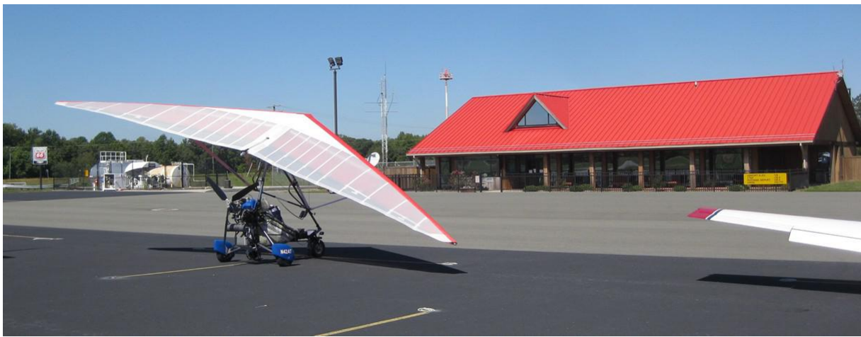
Trike at Tappahannock (ESX), wing canted into the breeze

I stayed only two hours in case the return trip was as slow as the trip out. With sunset at 7 pm, I left at 3. Surprisingly, the air was not all that bumpy. It really was a superb day for flying. Still, I climbed to 4,800 ft looking for calm air; didn't find it, but did find a 20 mph tailwind, so I was home in 2:40. The trip home is always less interesting than the trip out, so I was glad to go high and fast. (Well, 80mph - including the tailwind - is fast for me.) I'm sure that Lee was home at Shannon before I reached the gas pump at Tappahannock (below). If only I could fly the trike out and the Mooney back, I'd have it made.