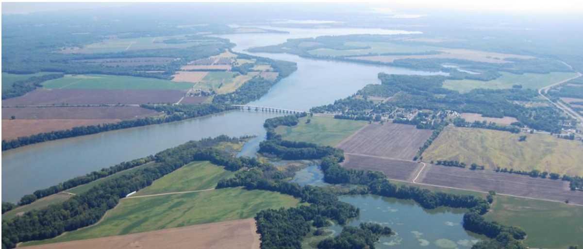
Rappahannock River, looking downstream from Port Royal, Virginia, below Fredericksburg