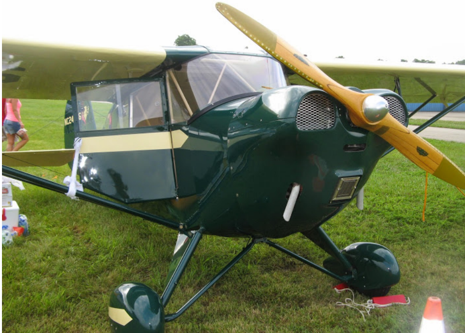
Restored pre-war Chief which won high honors at Middletown