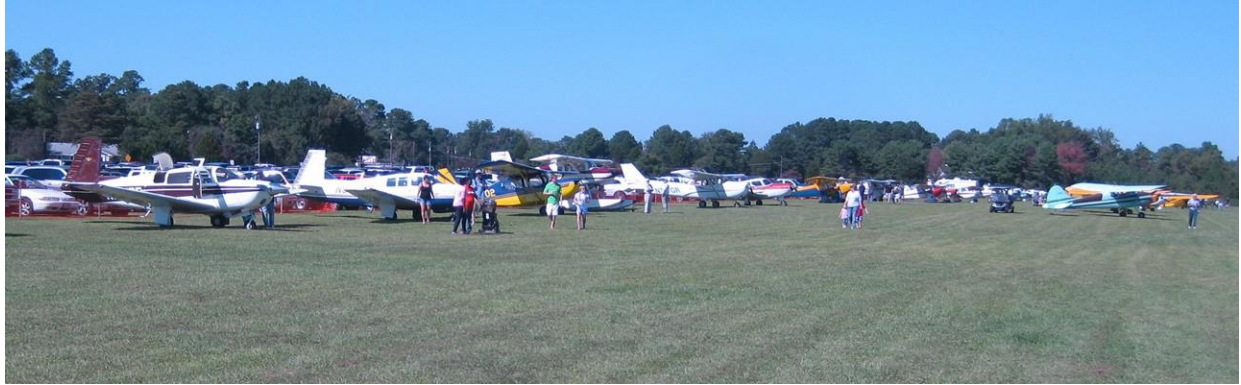
Lee Fox's Mooney on display at left