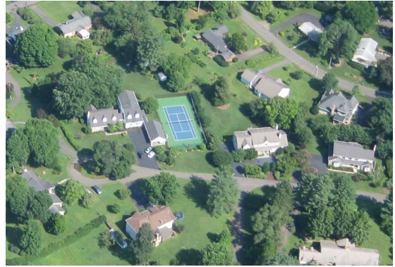
Uniquely, this court is in the middle of Warrenton.