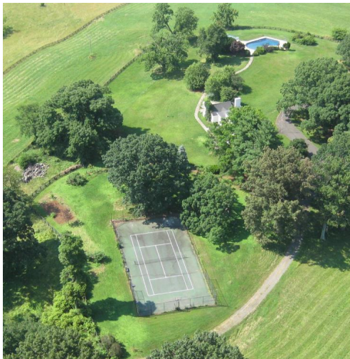
Slight low places in the court collect puddles, which become slimy when damp and black when dry, as here.