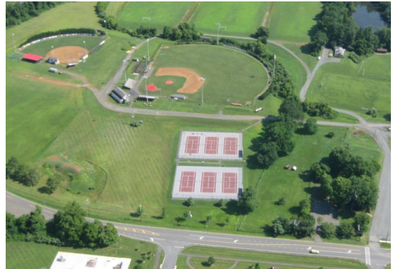
Fauquier High School.