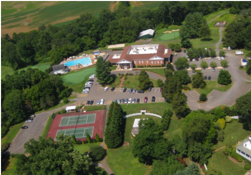
Fauquier Springs Country Club