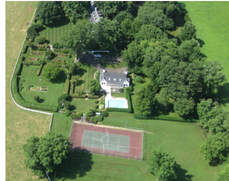
See the cracks in the court? There's more to maintaining a tennis court than you might think.