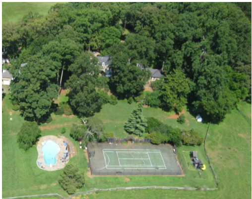
Notice the kids' fort on the right and the new pool at left. This is the grandparents' house?