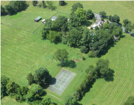
This court currently has no fence! That's a game-stopper!