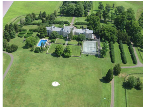
This is the fanciest estate for miles around. You county residents probably know it.