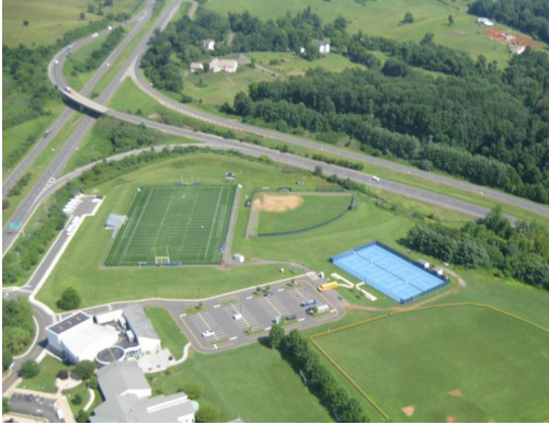
Highland School in NW Warrenton.