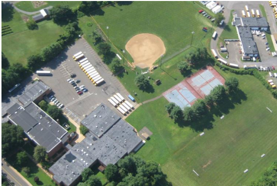
Warrenton Middle School.