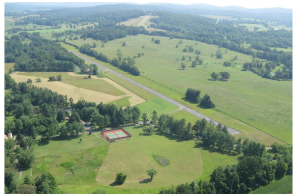
The courts at Airlie, looking north. The skeet range is between the courts and the runway. They shoot towards the runway.