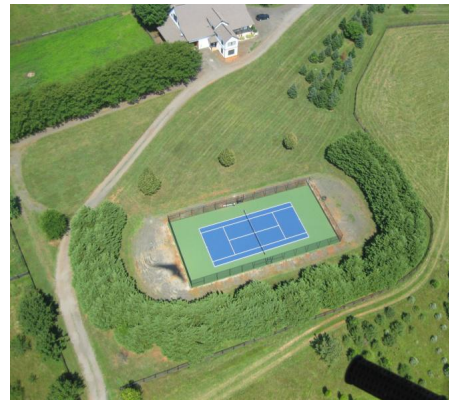
This is the one just NW of the Airpark.