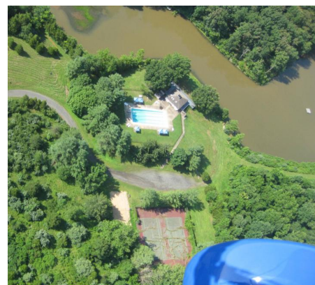
Abandoned courts at what looks like a small swim and racquet club, not a residence. Tennis anyone? Apparently not.