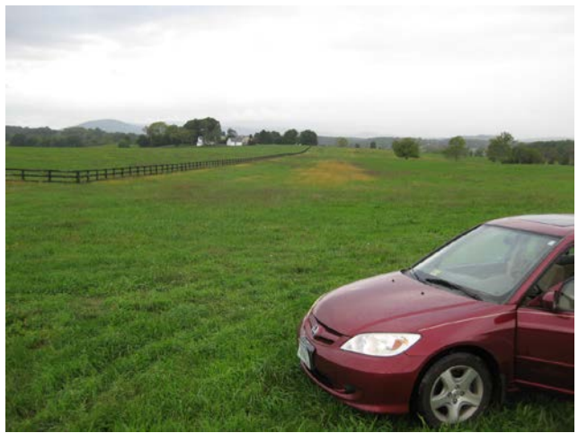
Runway 30, 1,600 feet

Care to buy an airport? The former Harris Field is for sale in far northwest Fauquier County. It has two grass runways on high ground clear of trees with good approaches. Beautiful views of the Blue Ridge—50 minutes from the Beltway. The asking is $1.8 million, but make an offer!