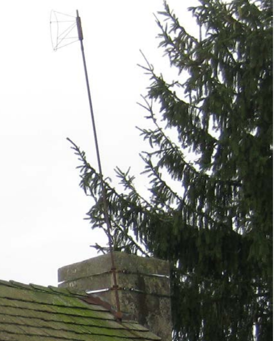
Remains of the wind sock

See the airfield in Google Maps at <u>http://goo.gl/Mhfr0</u>. The coordinates are 38.912558, -77.881651