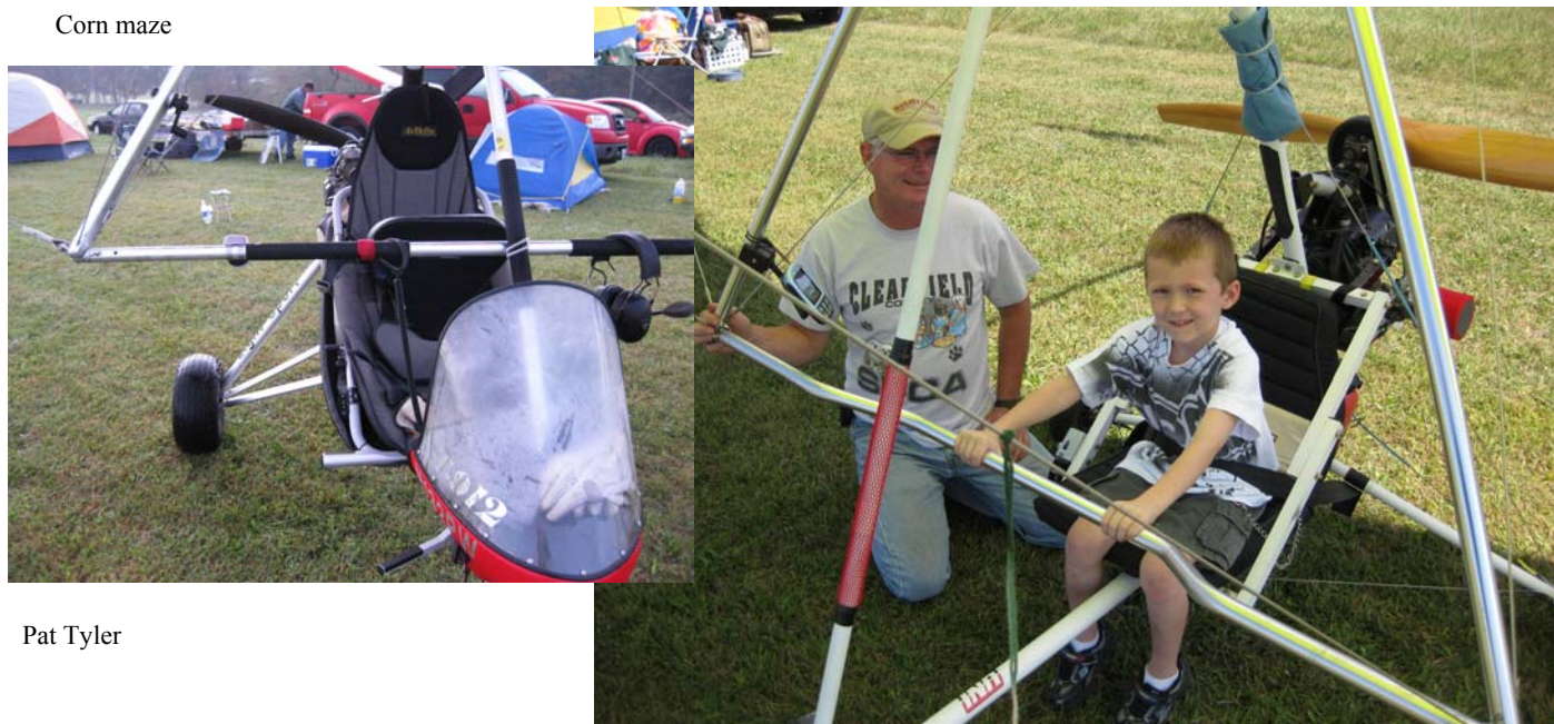
Trikes so easy a kid can fly 'em