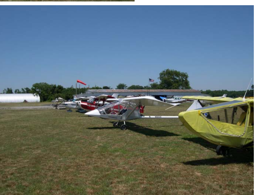
Here's a shot of my Kolb Mark III Extra, second from front:

Landed at Campbell on runway 21 with a little burble and a few bounces. The wind was starting to pick up. This is a shot of 21 looking south.