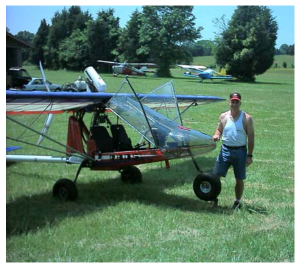
Rich's RANS S-12 Trainer