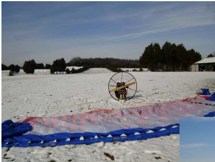
Ready for takeoff