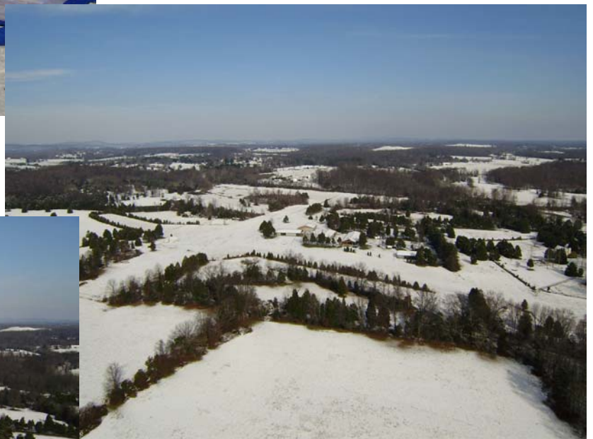
Warrenton Airpark in White