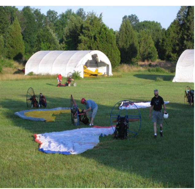
Woody and Phantom