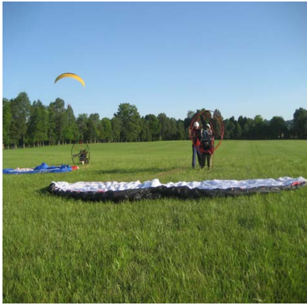
Very Early Start