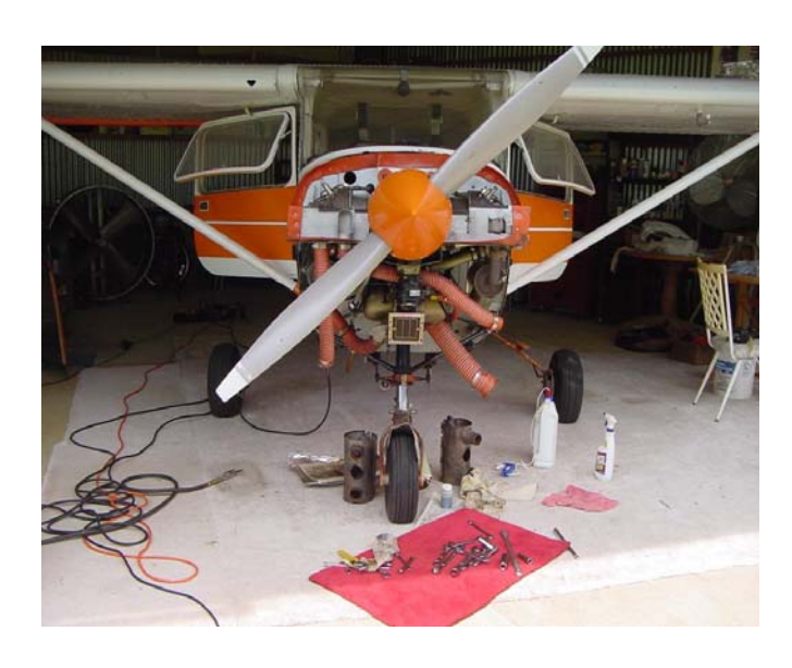
Under Construction, Photo By Larry Walker