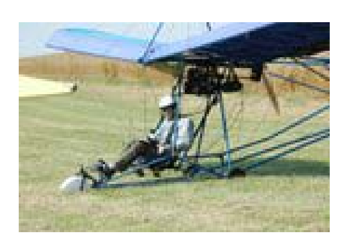
Ready for Take Off