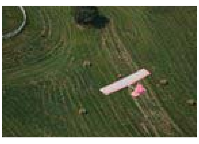
Pink Poker Run