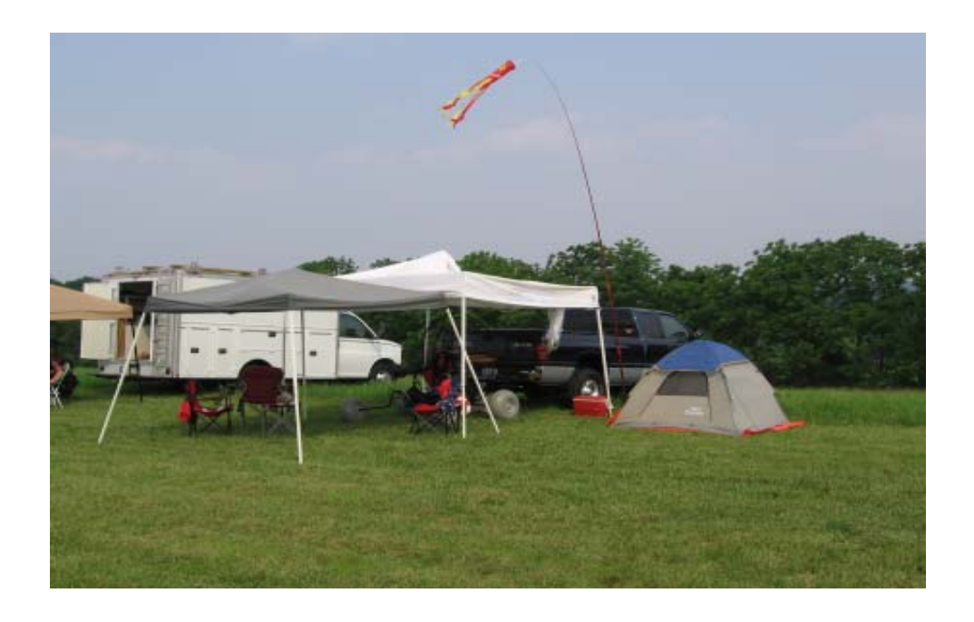
Marine Expeditionary Force HQ for the Father's Day Fly In

The several club members who flew up to Footlight Ranch for their annual Father's Day Fly In had a great time.