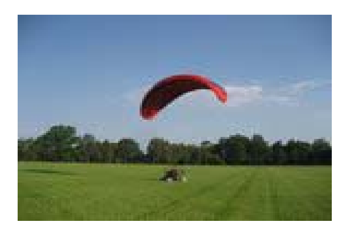
Take Off from Tharpe