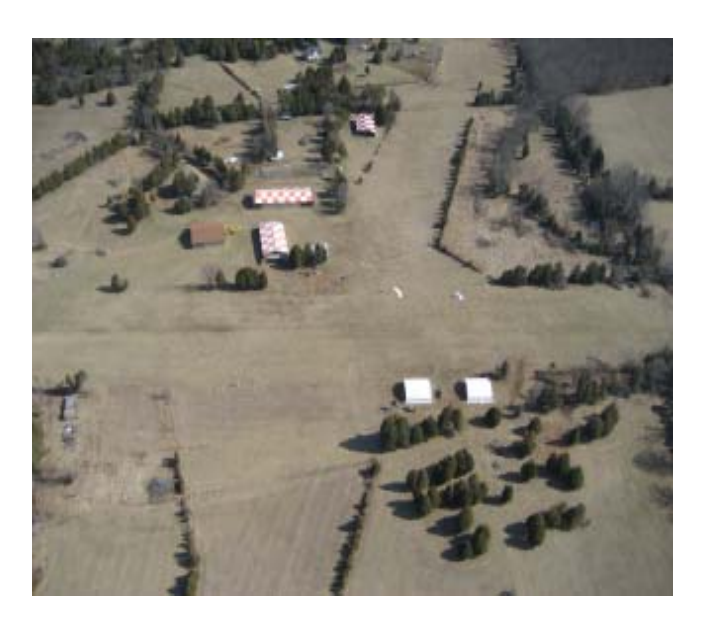
Laying Out for Takeoff Flight -- WAP

Flight instructors. While our club does not officially endorse any individual flight instructors we are now fortunate to have both fixed wing and powered paraglider instructors available in our area. If you have friends looking to fly these folks could be a valuable resource.