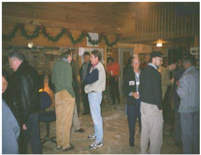
Club 1 Holiday Party at the Club House in 1999.