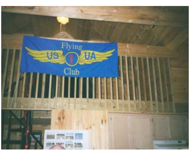
Our Banner on the upstairs railing at the Club House