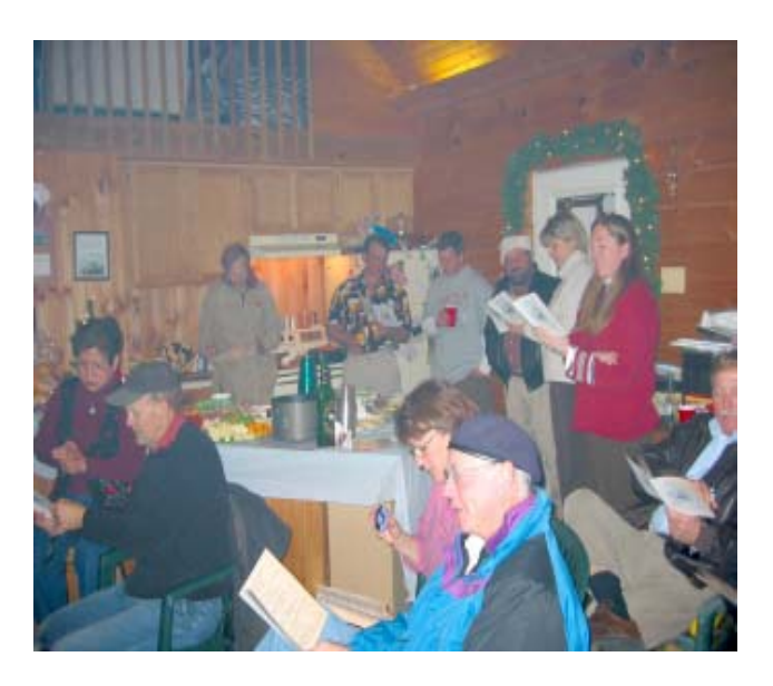
Club members join the Tabernacle Choir for a few songs.