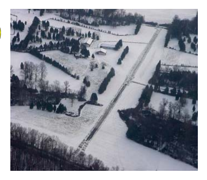
And then there is winter at the Air Park, sometimes even with snow!