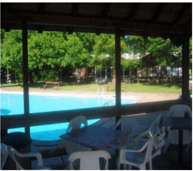
Looking toward the Florida Keys Restaurant from across the pool.

Won't you join us there on June 17^{\rm th}, or 17^{\rm th} and 18^{\rm th}?