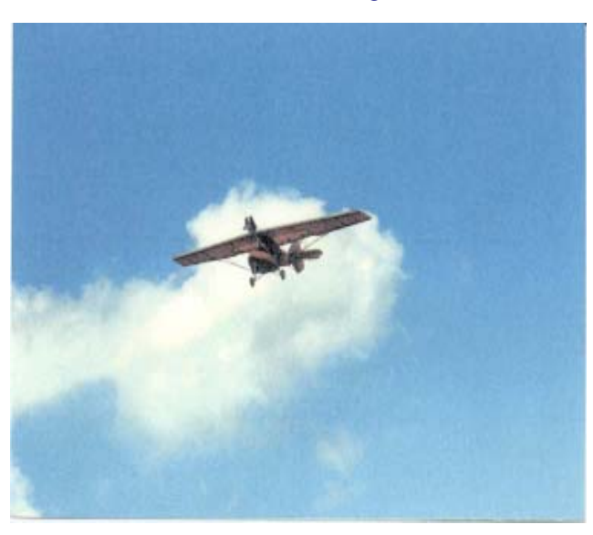
On Final to 23