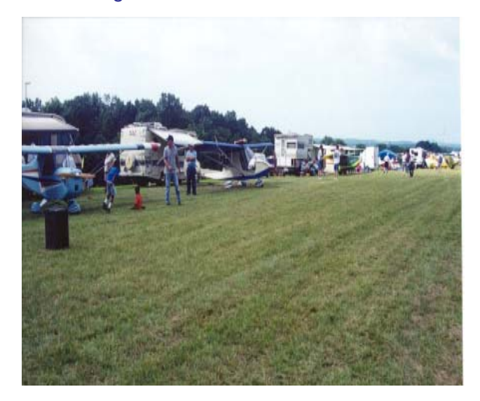
The Shreveport North Flight Line Looking West