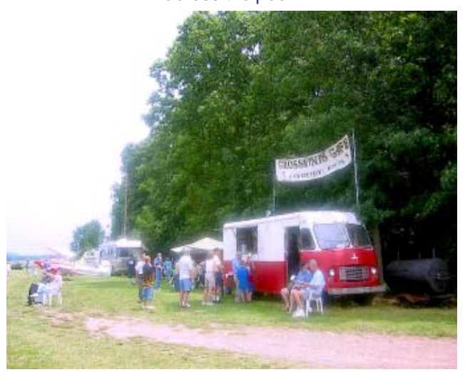
The Flight Line Lunch Wagon