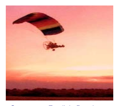
Sunset over Footlight Ranch