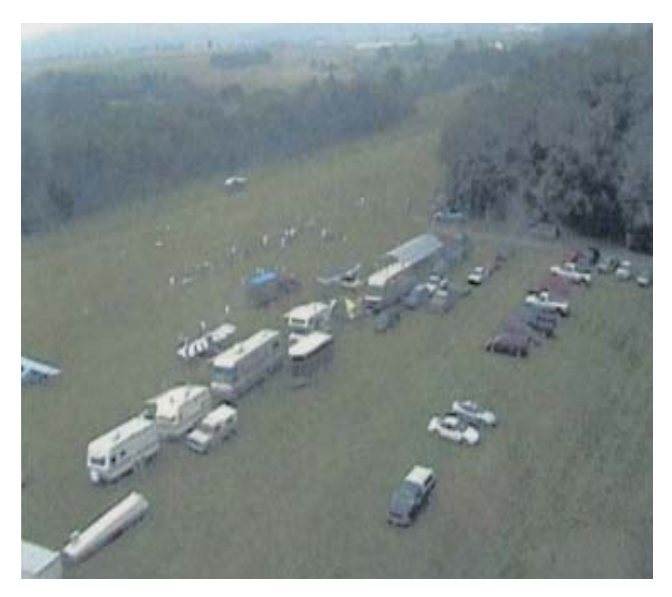
An Aerial of the Flight Line