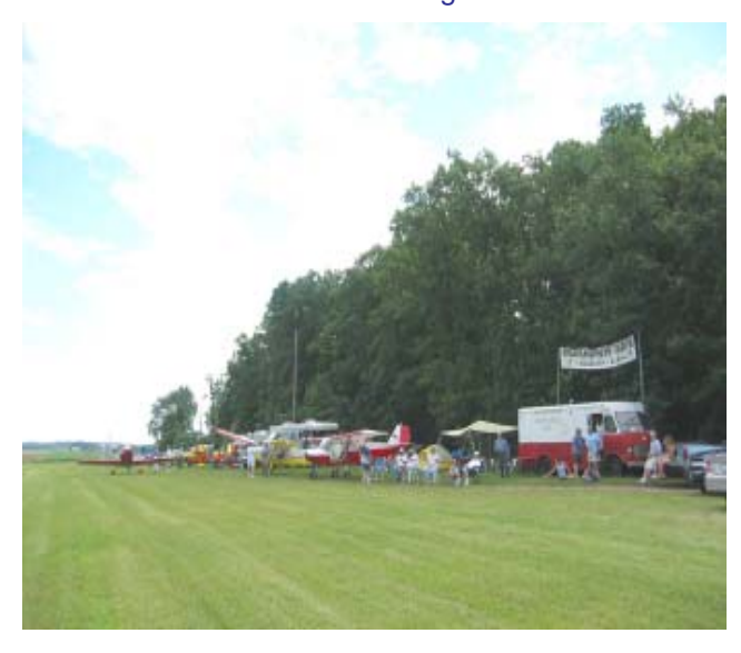
The East End of the Flight Line