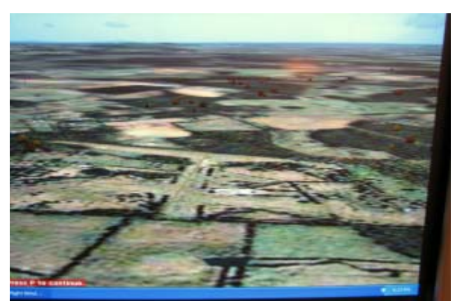
The Air Park from the South