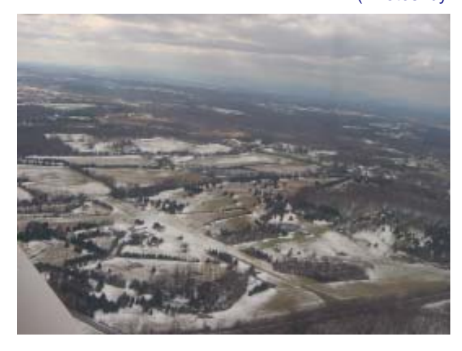
Warrenton Air Park, looking SW