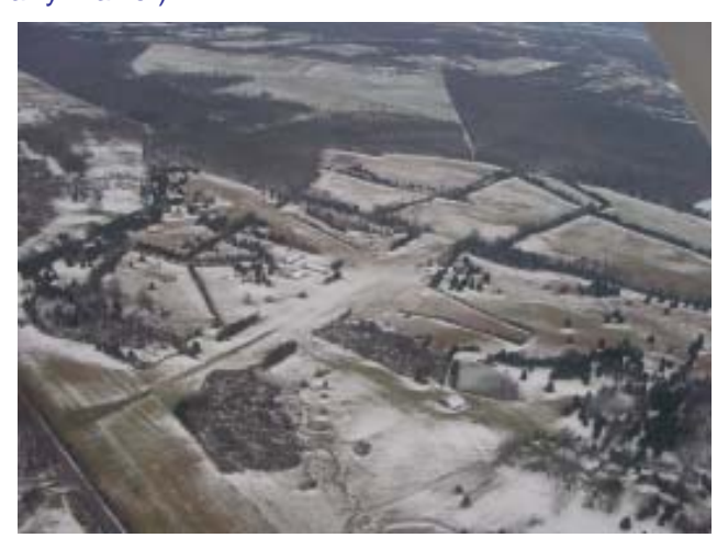
Warrenton Air Park, looking SE