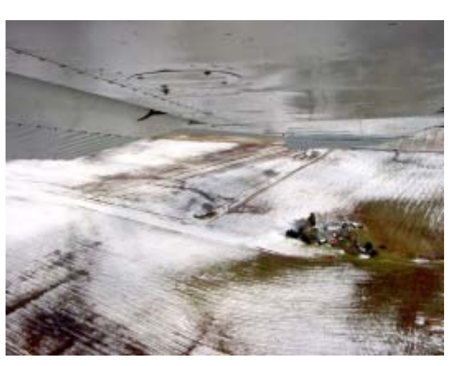
Lenn Brothers' Field, looking NE