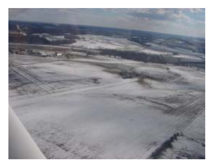
Lenn Brothers' Field, looking SE.