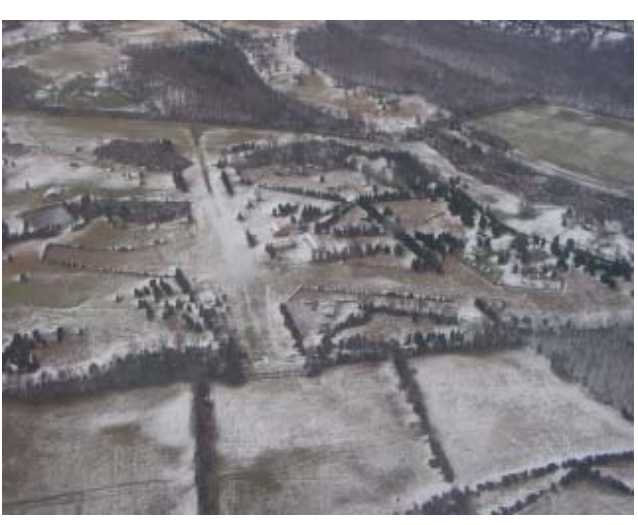
Warrenton Air Park, looking NE.