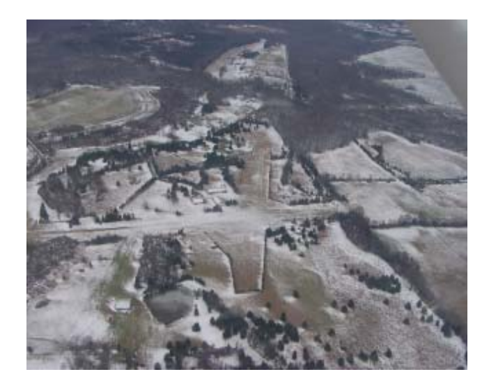
Warrenton Air Park, looking east.