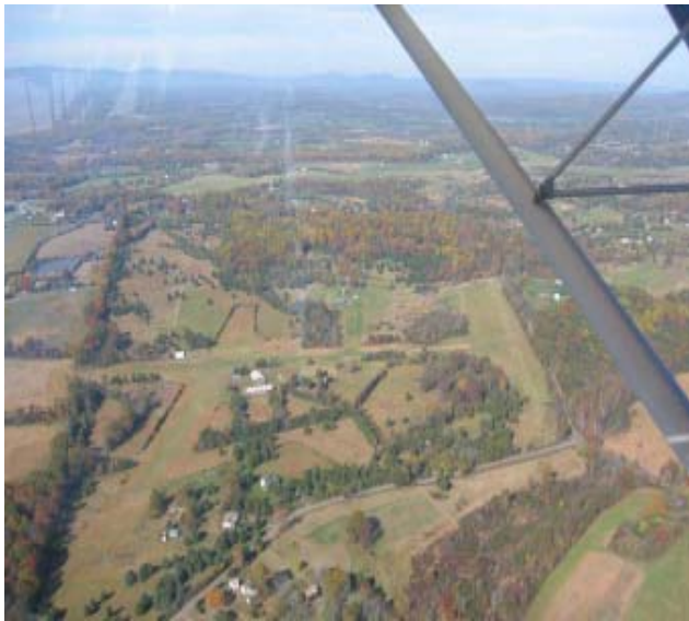
The Warrenton Air Park, Fall 2005

Ads will be run twice and then dropped unless resubmitted, or renewed by telephone or e-mail. Please advise the editor when the ad is no longer needed.