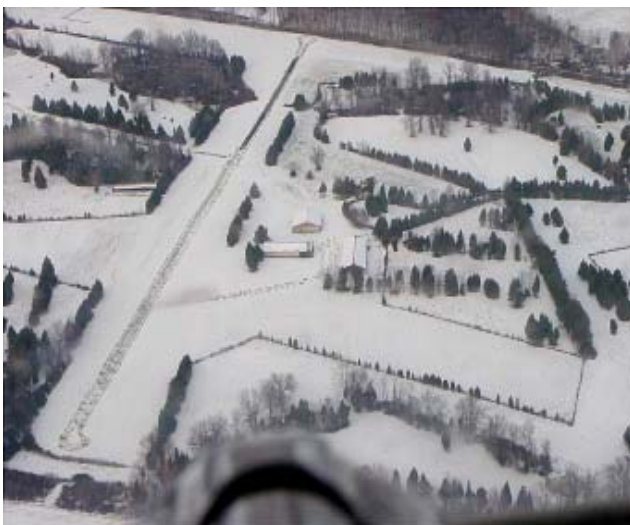
Warrenton Air Park in Winter Sign of things to come?

FLIGHTSTAR II SL , 1998 - 582 Rotax w/E-gearbox, 86 hrs. All upgrades completed by Lockwood Aviation. Advanced EIS, w/vertical speed, alt, tach, EGT, CHT & water temp. Turn/Bank, flaps, trim and 1050 BRS. Magellan GPS, ICOM A5 radio, headsets & Sigtronics intercom. IVO prop, strobes, Hobbs meter. Blue. Sails are clear-coated. Beautiful ultralight, excellent flyer. Always hangared. $16,000. Can assist with delivery. 434-298-3940 Or e-mail: jkriley9041@earthlink.net in Blackstone, VA 23824 (10/05)