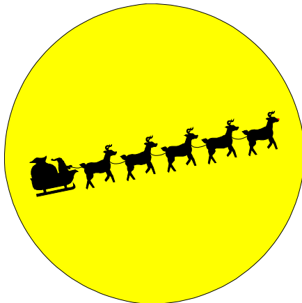
Will he land here this year?