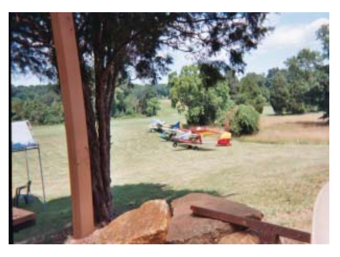
Warrenton Air Park after a Poker Run