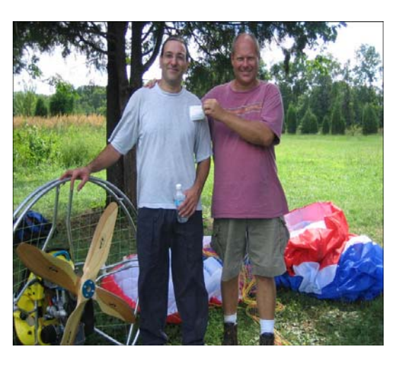
For another solo, this one a Sport Pilot solo, see pages 6 & 7! Club 1's first Sport Pilot!