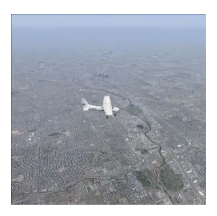
Denver, Colorado. Its downtown with its tall buildings can be seen just over the plane's left wing.

Preview screenshots can be seen at <a href="https://www.megascenery.com">www.megascenery.com</a>. I'm including one shot copied from that web site that gives you an idea of just how real it can be.