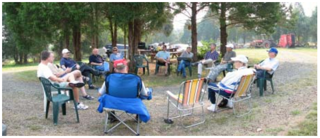
September Meeting of Flying Club 1 Warrenton Air Park