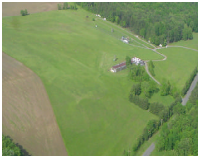
Flying Circus Field looking to north-east. Road into field at upper right. The Flying Circus hangar and building are just above right center. Straight above them, separated from the treeline, is the white building where Flying Club 1 will congregate for its Memorial Fly-in. Car parking will be in the area between the white building and the trees.

The Flying Circus is located 14 miles south of Warrenton, Va and 22 miles north of Fredericksburg, VA. Turn left off of Rte 17 onto Rte 644 3.8 miles east of Rte 28. The Flying Circus Airfield is 1 mile north on the left side. Please use the second entrance into the field.