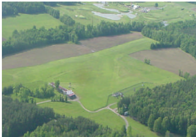
Approach to 34, Flying Circus Field