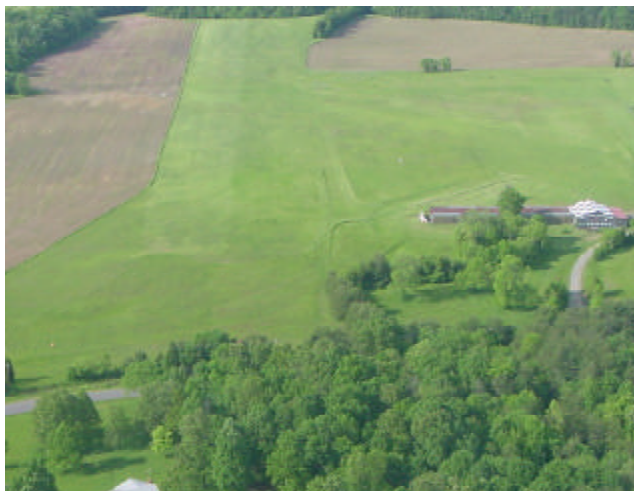
Approach 02, Flying Circus Field

Items bought and sold through this newsletter are solely at the risk of the buyer and seller. Neither the newsletter nor USUA #1guarantees, or is in any way responsible for, the airworthiness or other aspects of the items offered.