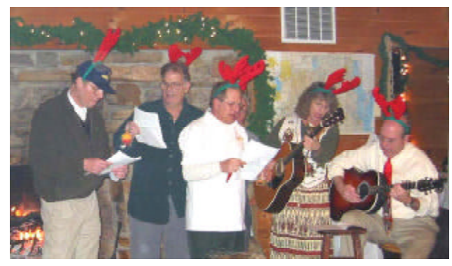
The Rotax Tabernacle Choir in Its Third Annual Appearance at the Warrenton Airpark

Rotax Tabernacle Choir will be creating a music CD of the evenings performance, which should be available for purchase by the January Club Meeting. All proceeds from the sale of the CD go to Club 1.