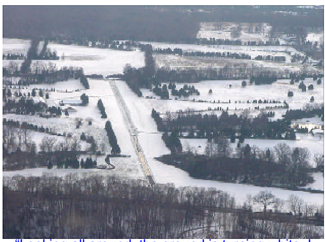
"Looking all around, the ground is turning white, I don't care a wit, I'm going on a flight" - "Ultra-lights" by the Rotax Tabernacle Choir

A new mounting kit for the installation of the HKS-700E on CGS Hawk 2 seat ultralites is now available. Designed and perfected by Jim Willess of Northern Virginia Ultralites, the kit includes all hardware required for the installation. The kit includes mounting hardware for the engine, oil cooler, oil tank, and other required elements of the HKS engine. The actual adaptor plate is made from heavy gage aircraft aluminum and is predrilled machined for a perfect fit. There are plans for additional HKS engine adaptors for other airframes. The projected price of the complete kit is $550.00. If you are interested in the HKS-to-Hawk adaptor or want an adaptor designed for your airframe, contact Jim Willess of Northern Virginia Ultralites for additional information.