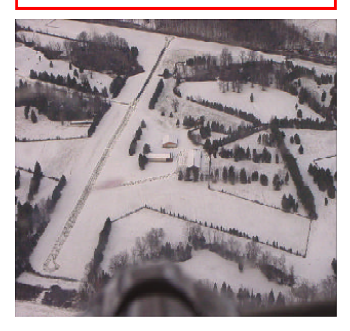
On a Cold Winter's Day - over the Warrenton Airpark.

2002 Club members are reminded that dues for 2003 are due. Dues may be paid by check to the Treasurer at the next Club meeting or may be sent to him at the address given at the bottom of the membership form (inside back cover of this newsletter). A completed membership form <u>must</u> accompany payment.