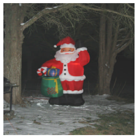
Santa Greets Us as We Arrive at the Holiday Party

At the Clubhouse, industrious Club members had been there before us, decorating and preparing it for our party.