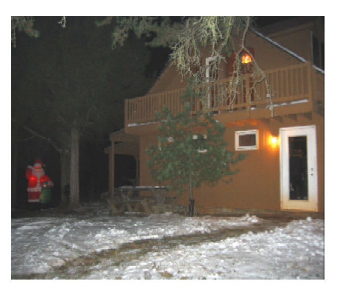
And, To All - a Good Night!