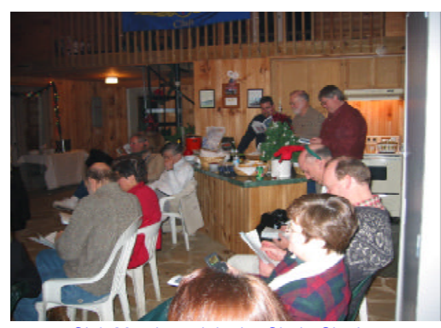
Club Members Join the Choir, Singing "Gramma Got Run Over By a Reindeer".