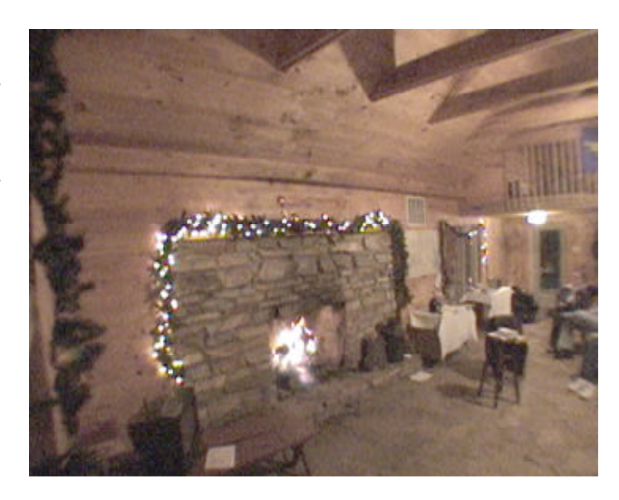
A Roaring Fireplace to Warm Our Festivities

were all heading homeward with a few jingles and Ho Ho Ho's in our heads as this evening had given our Christmas spirits a little jumpstart.