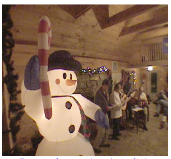
Frosty, the Snowman, fronts for the Choir.

As you can see from the pictures, the Choir was joined this year in a special guest appearance by Frosty the snowman. Frosty was quite popular with the crowd, and after the musical presentation was completed many people just could not resist the